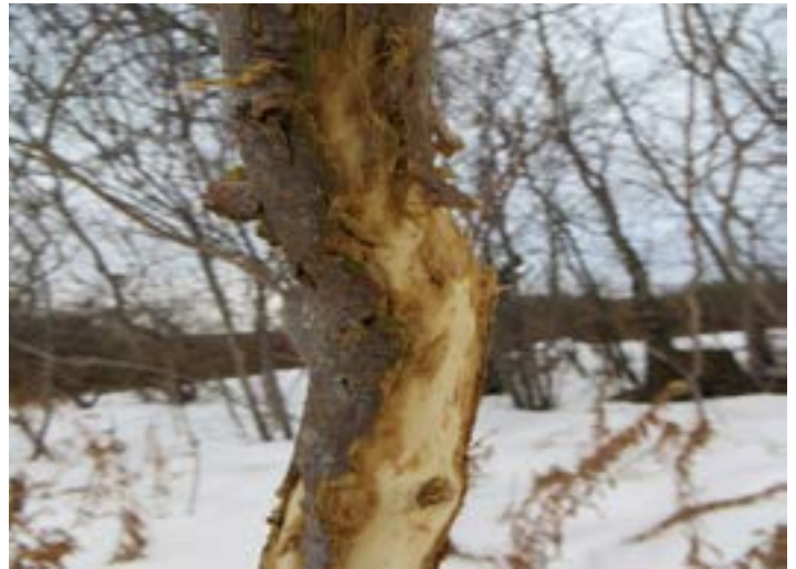
Antler Rub on Sumac (Guelph Lake, November 2014)

At the back pond, we found a crayfish chimney. As the crayfish burrows down into a water-filled tunnel, it uses